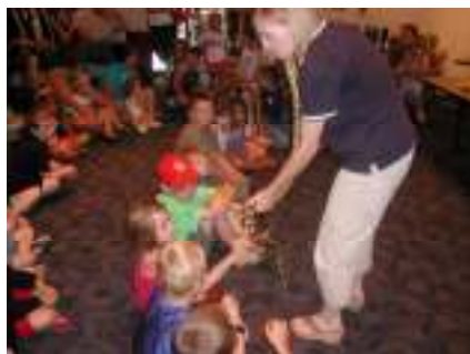
Creepy Crawlies at the Summer Reading Program 2008.