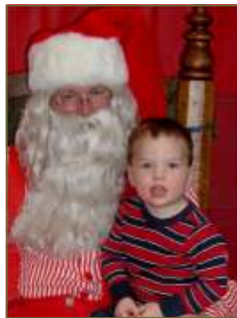
Santa visits the library, 2009