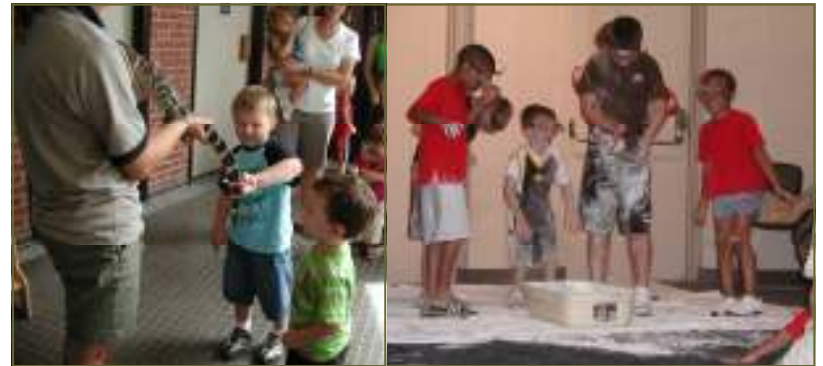
Summer Reading Program 2010: Blank Park Zoo, and Mad Science!