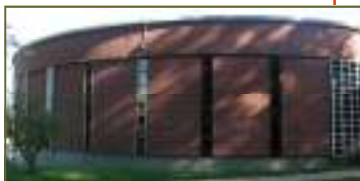
New Windows in 2010!