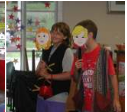
Patchwork Puppets perform Hansel and Gretel, SRP 2009

Program Attendance 2,037 (115 more than last year!)