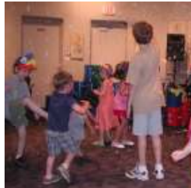
Summer Reading Program 2009

Items Borrowed 80,562 (2,981 more than last year!)