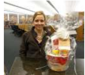
Adult Winter Reading Program winner, 2016