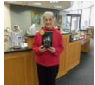
Adult Winter Reading Program winner, 2014