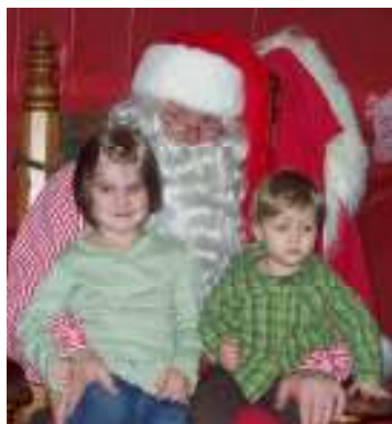
Santa visits the library, 2010